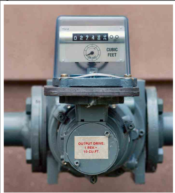
Figure 2. Natural Gas Meter

Install linear Hall-effect sensors in multiple locations inside the meter to detect the abnormal presence of a magnetic field. Send an alarm to the utility company or record this fraudulent activity in memory for processing at a later date.