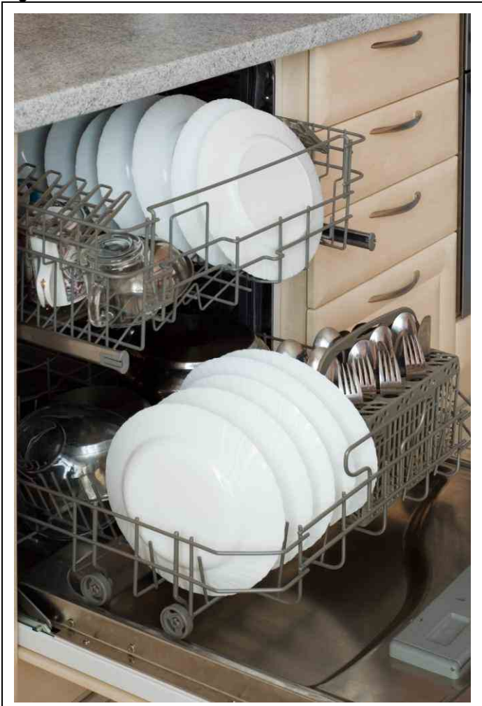
Figure 6. Dishwasher

SS39ET/SS49E/SS59ET Series sensors can monitor the current powering the electromagnets in the pump's motor. If the current is not within its normal range, the logic could also perform overload or motor malfunction detection.