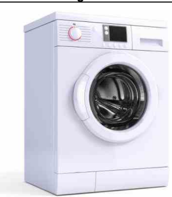
Figure 4. Washing Machine

A linear Hall-effect sensor generates an enhanced control signal for better resolution of the rotor position, which can improve the motor's efficiency.