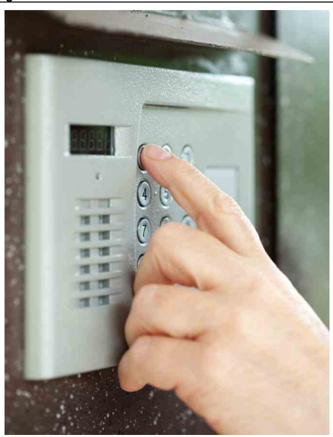
Figure 3. Electronic Locks

Without reproducing the exact magnetic flux pattern, it would be virtually impossible to unlock the system with a single, or even multiple, strong magnets. Tiny Honeywell SS39ET Surface-Mount Linear Hall-effect Sensor ICs would provide the needed sensitivity, output and very small size.